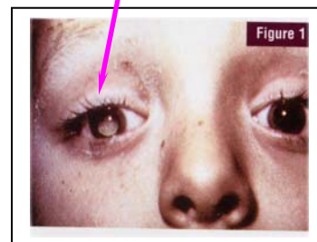
Parasite migration to the eye